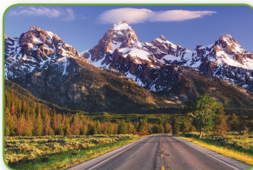
2 the Rocky _____