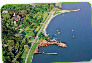
1 _____ Palić