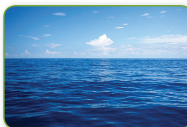
5 the Pacific _____