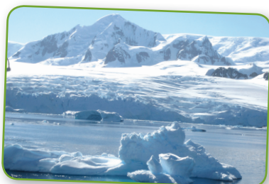
4 the North _____