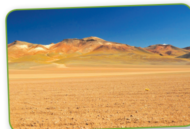
6 the Atacama _____

2 Match the names with the geographical features.