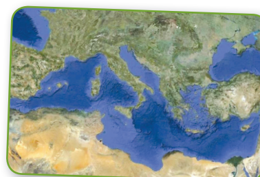
3 the Mediterranean _____